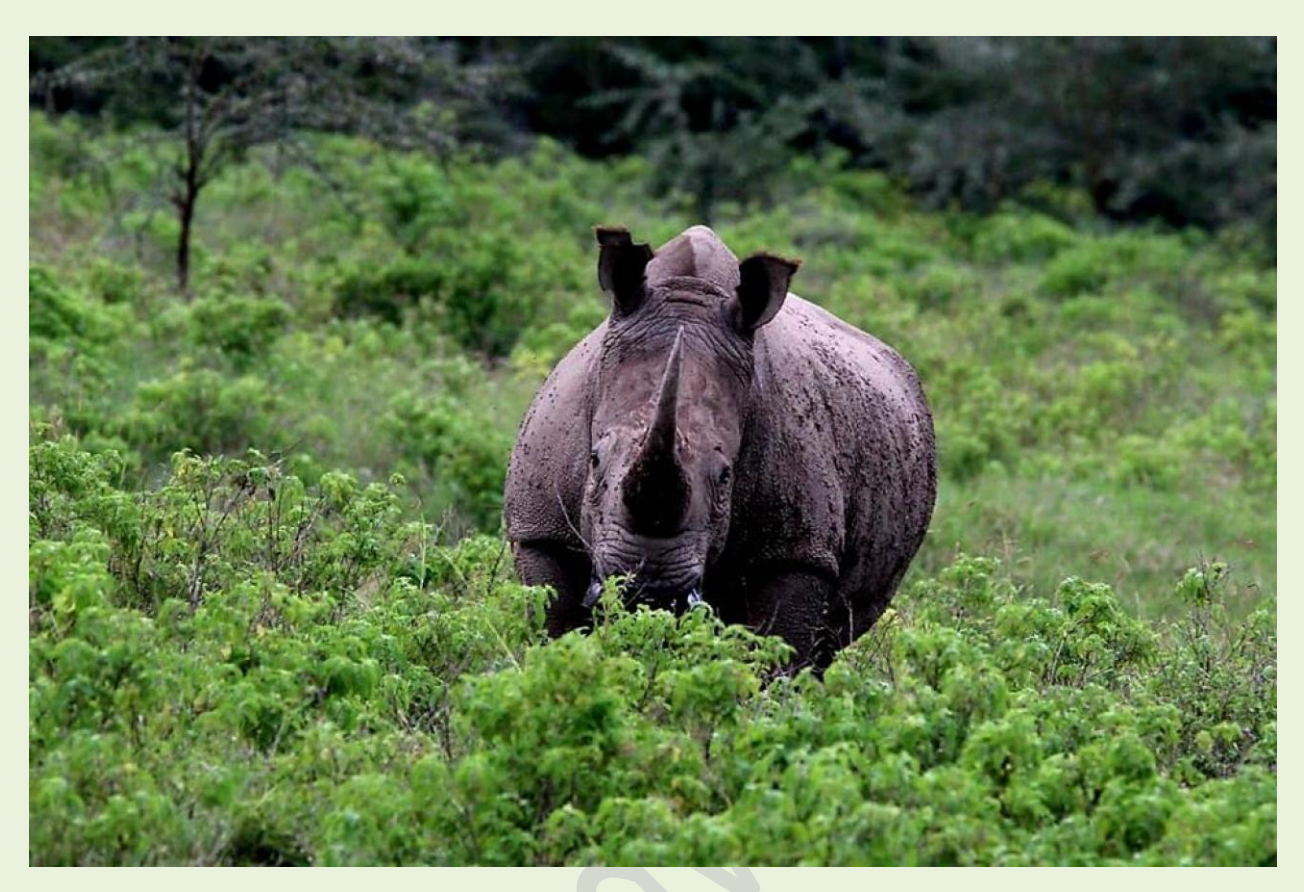
DAY 3: MASAI MARA - LAKE NAKURU NATIONAL PARK

Rise up early for breakfast, check out and depart Masai Mara for Lake Nakuru National Park. Lake Nakuru National Park offers you a rare insight into Kenya's most diverse flora, fauna and wildlife and is famous for its huge flocks of pink flamingos. The birds throng on Lake Nakuru itself, one of the Rift Valley soda lakes that comprises almost a third of the park's area. More than 450 species of birds have been recorded here as well as a rich diversity of other wildlife. Lions, leopards, warthogs, waterbucks, pythons, and white rhinos are just some of the animals you might see, and the landscapes range from sweeping grasslands bordering the lake to rocky cliffs and woodland. The park also protects the largest euphorbia candelabrum forest in Africa.