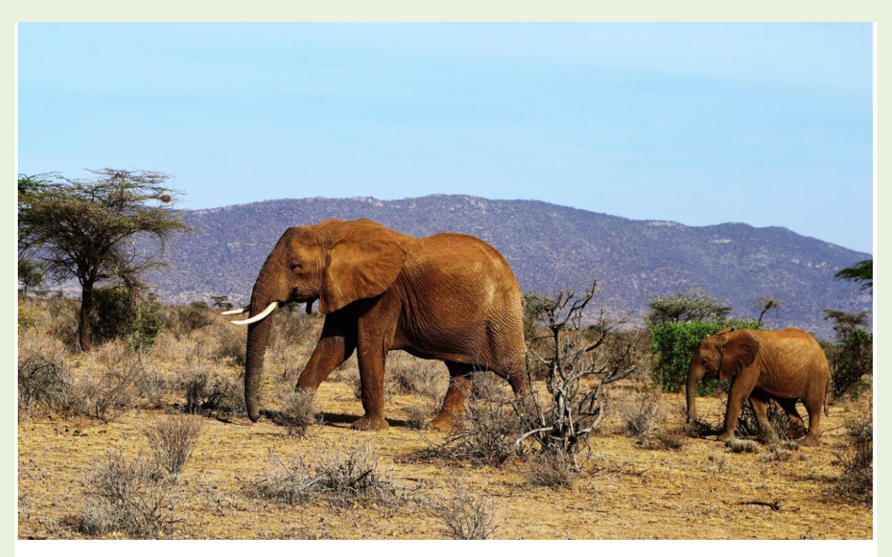
DAY 3: SAMBURU NATIONAL RESERVE - NAIROBI

You spend this last morning in Samburu admiring the unspoiled Africa as you prepare for a drive back to the buzzing Kenya's capital bringing to an end what we hope shall be a safari of your lifetime. We hope to welcome you back to magical Kenya! And as we say here, "Karibu Tena".