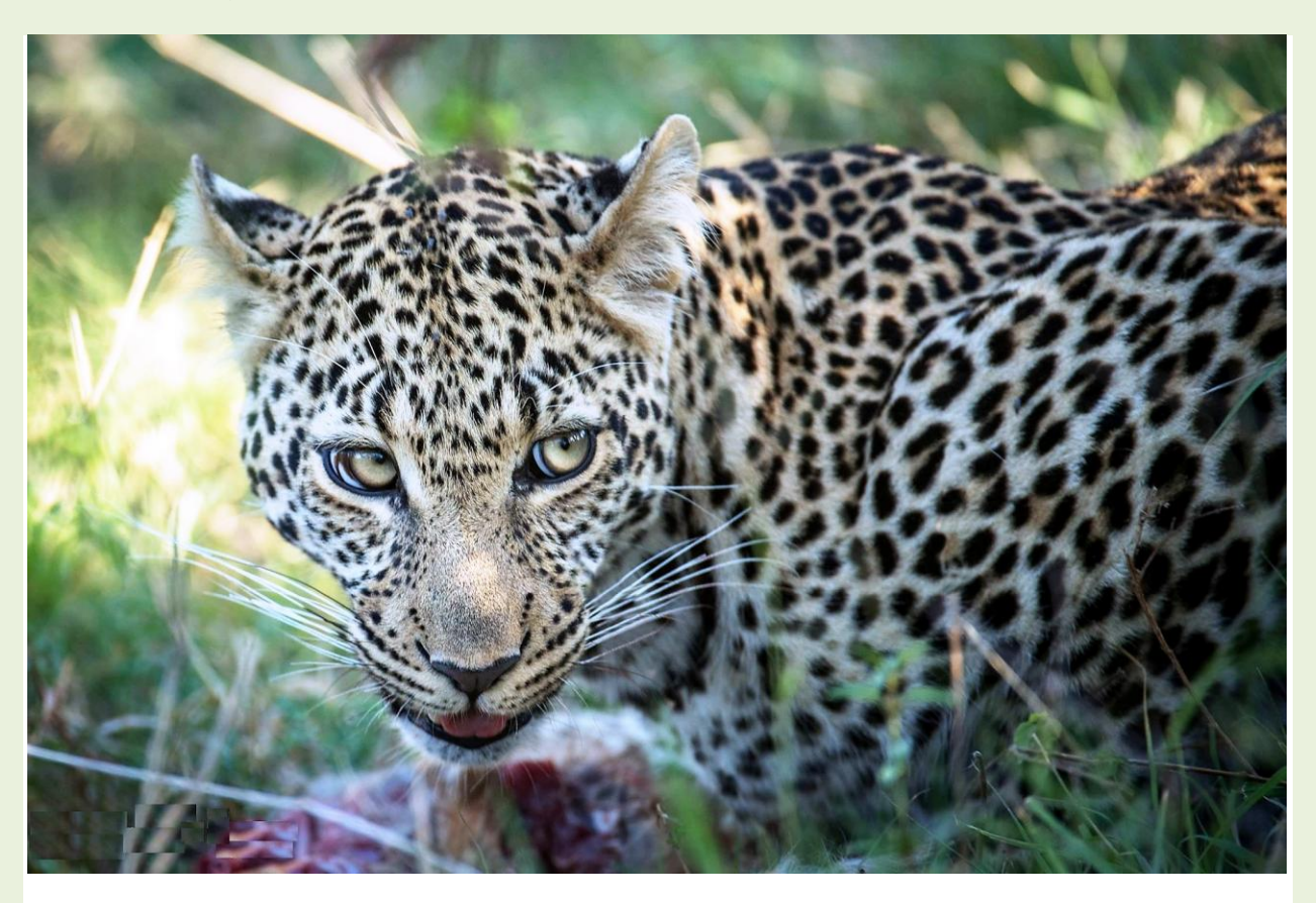
DAY 2: EXPLORE SAMBURU NATIONAL RESERVE

Meals & drinks: Lunch & dinner (Breakfast not included) Drinking water (Other drinks not included)